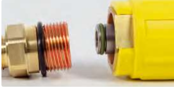
Dust protection seal o-ring