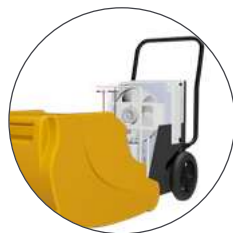
Easy to open for cleaning