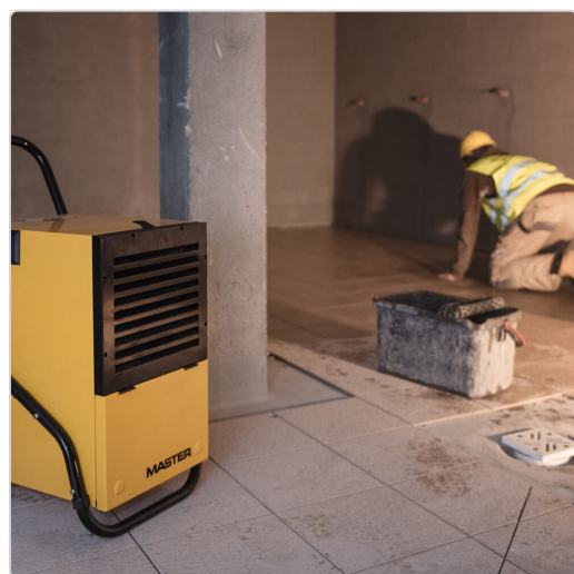
Master DH 752 tiling