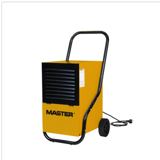
Master DH 752

Highly efficient machines designed to operate in harsh work conditions. Ideal for industry and construction. Sturdy and cost-effective range of portable dehumidifiers ideally suited for projects in the construction industry, restoration jobs, water damage control and more.