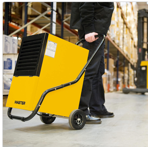
Master DH 752 Warehouse