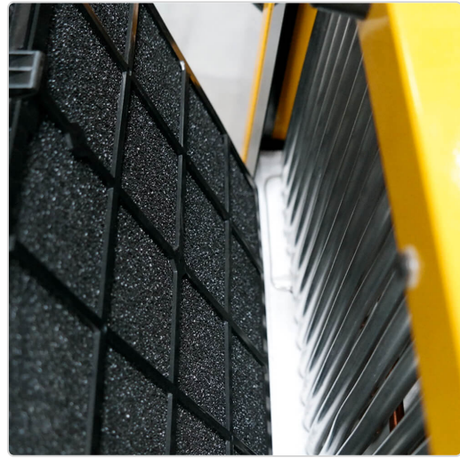
Compact foam air filter enables work in very dusty spaces