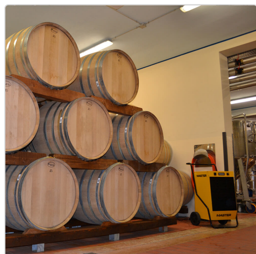
Master DH wine production