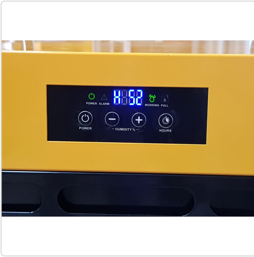
Digital control panel